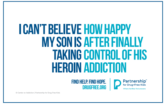
"Marriage" TV PSA