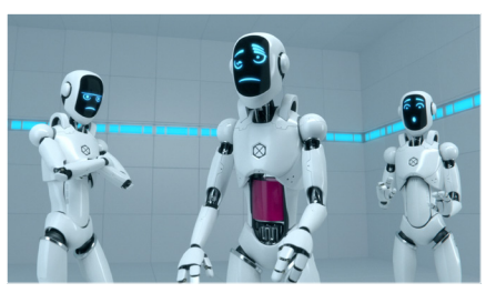
Screenshots from DXM Labworks video game app